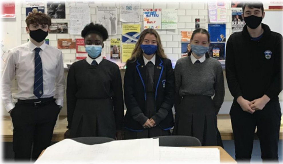
Rights Respecting Schools Steering Group, finalising plans for our Bronze application.

Our Rights Respecting Schools Steering Group has worked hard to complete our application for Bronze Rights Respecting Schools status. They are working with the Pupil Voice team to elect Rights Respecting Schools Ambassadors and making plans for 2021.